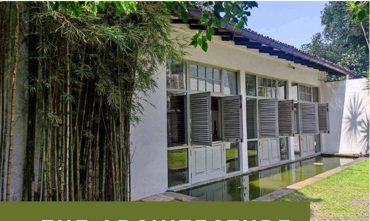
De Seram House, Colombo