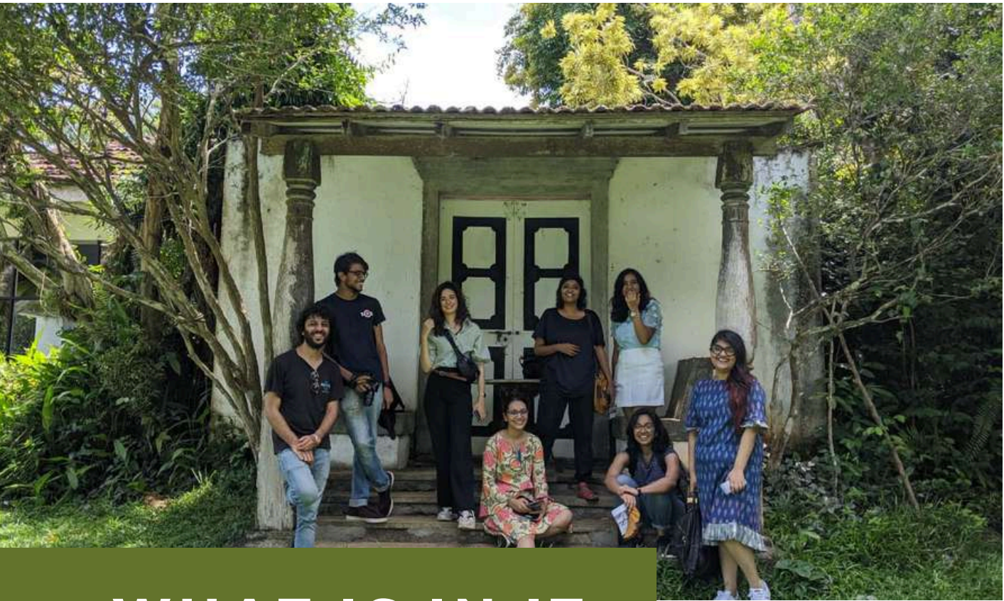
The October 2019 batch at Lunuganga Estate by Geoffrey Bawa